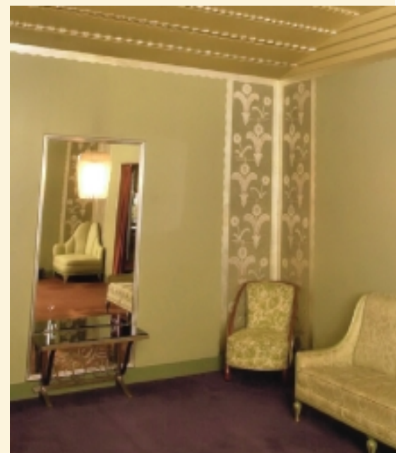
Ladies lounge with Vitrolite table

After a cost analysis study, David quickly realized that the glass repair